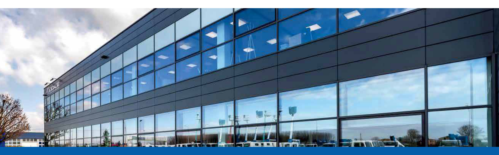
SOCAGE, AERIAL PLATFORM CONSTRUCTOR ALL OVER THE WORLD